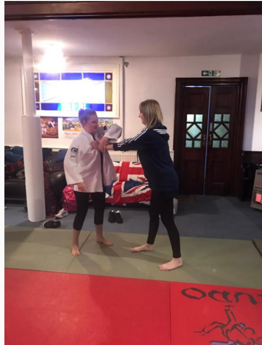
EGH Studio Self Defence Class