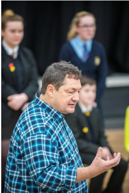
Spectacle Interactive Theatre Workshop